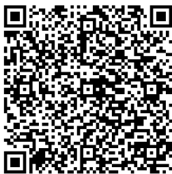
DoubleTree Hotel Reservation